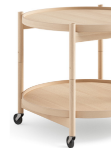
Beech, Oiled BBO3-BOL-VV