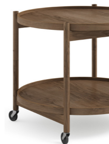
Fumed Oak, Oiled BBO3-OFU-VV