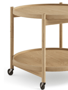
Oak, Oiled BBO3-OOL-VV