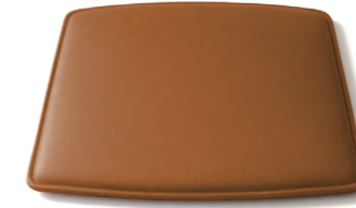
Spectrum, Brandy Leather - 30155