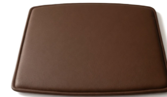
Spectrum, Cinnamon Leather - 30146