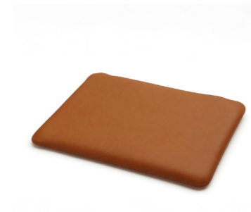
Spectrum, Brandy Leather - 30155