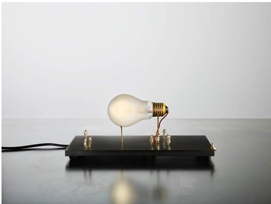
I Ricchi Poveri - Monument for a Bulb INGO MAURER 2014/2022

Steel, brass, eight figures made of nickel silver. The base plate is made of solid, untreated steel, cut with a guillotine shear. The resulting rough-cut edge is a characteristic feature of the industrial design so loved by Ingo Maurer. Monument for a Bulb is equipped with an Ambient LED light source, developed exclusively by and for Ingo Maurer. Ambient LED is the contemporary LED alternative to the incandescent bulb: the more it is dimmed, the warmer the light becomes