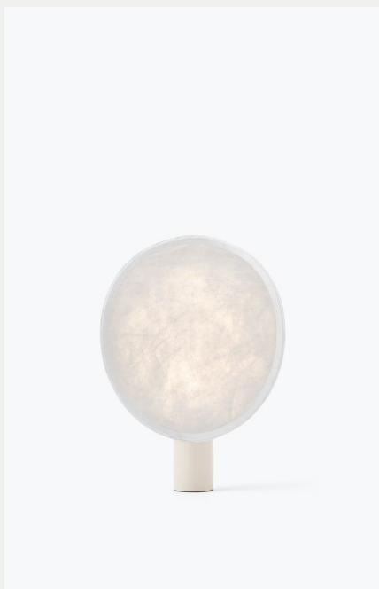
Variant White Base w. White Tyvek Item No 21810 EAN No 5712826218105