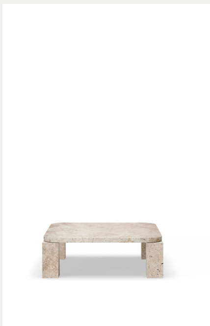
Variant Unfilled Travertine Item No 42610 EAN No 5712826426104